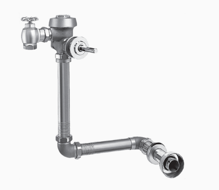
Variation Not Shown: 1" Straight Control Stop