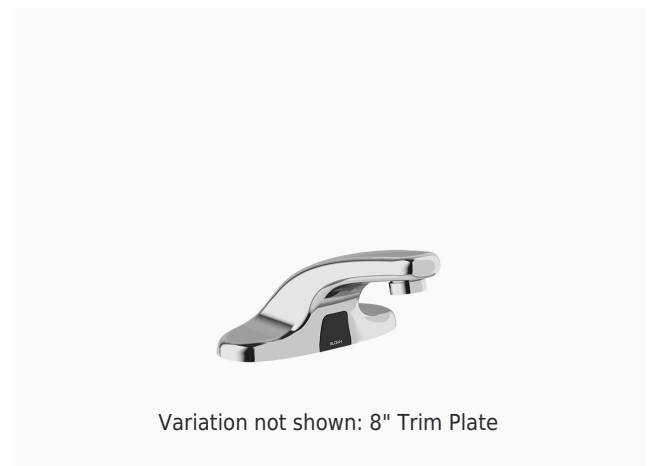
Variation not shown: 8" Trim Plate