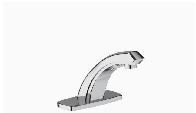
Variations not shown: Above Deck Mixer with 4" Trim Plate