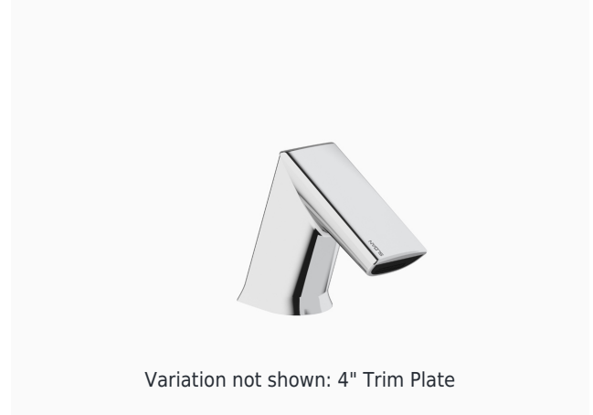
Variation not shown: 4" Trim Plate