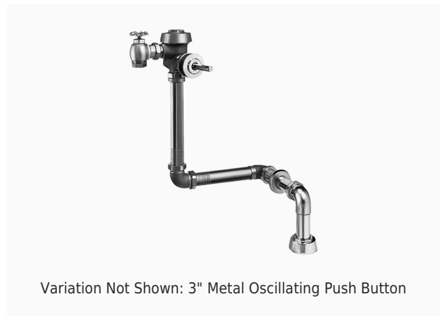
Variation Not Shown: 3" Metal Oscillating Push Button