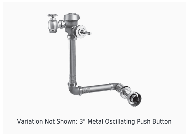
Variation Not Shown: 3" Metal Oscillating Push Button