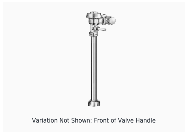
Variation Not Shown: Front of Valve Handle