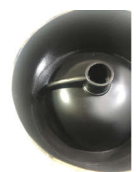
Overflow fitting close-up